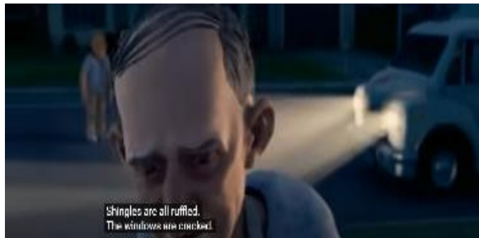
Selected Scene 10. The house's shingles looking ruffled as described in dialogue