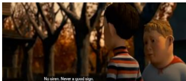
Selected Scene 5. DJ suspiciously observing and saying "No siren. Never a good sign" Source: Captured and documented by the researcher from Monster House (2006)