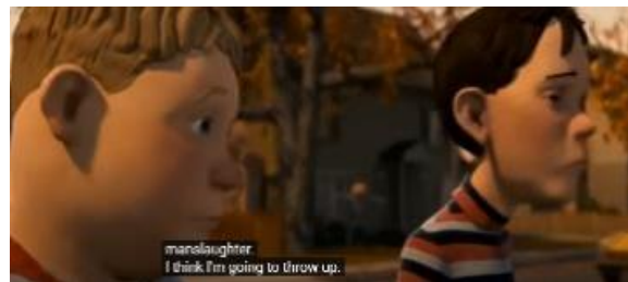
Selected Scene 3. DJ’s reacting in disgust while saying “throw up”

One of the children uses the phrase “throw up” to describe vomiting in a disgusted reaction. Bodily slang is a very prevalent term used in young people’s speech to casually or humorously describe physical interactions. Even today, people of all ages and on all platforms use it to express something repulsive or overwhelming “I could throw up” is a common TikTok comment or group chat response. It captures the innocent yet dramatic way children express powerful feelings, giving the characters in Monster House more authenticity and relatability. This phrase demonstrates the straightforwardness and simplicity of child-oriented slang in contrast to the formal or coded vocabulary seen in Fast Five .