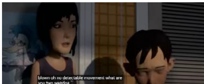
Selected Scene 1. Zee calling DJ and Chowder "weirdos" to mock their behavior