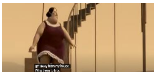
Selected Scene 9. Constance threatening to "whip them to bits"

Yelled by the house's spirit, this phrase dramatizes the idea of complete destruction. As a Teen/Secret Slang, it exaggerates harm in a way that remains digestible for younger viewers. Such hyperbolic threats are still used today in gaming, humor, and online rants, keeping it relevant. The phrase also deepens the house's menacing presence while preserving comedic flair. Fast Five favors real-world violence and military phrasing, lacking metaphorical flair. Yuda Pramana & Santika didn't address metaphorical slang, making this study's attention to stylized expression a novel angle.