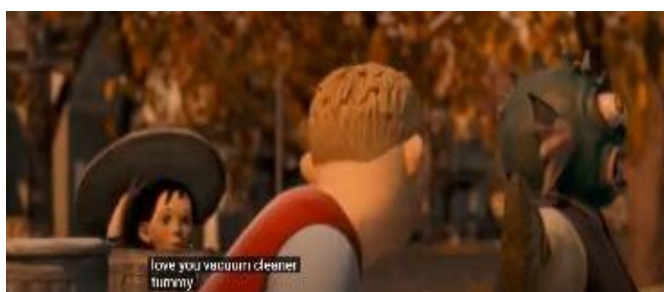
Selected Scene 18. The casual use of "tummy" in a childish conversation Source: Captured and documented by the researcher from Monster House (2006)