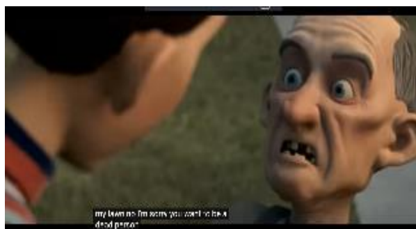
Selected Scene 22. Nebbercracker yelling "dead person" in a moment of panic