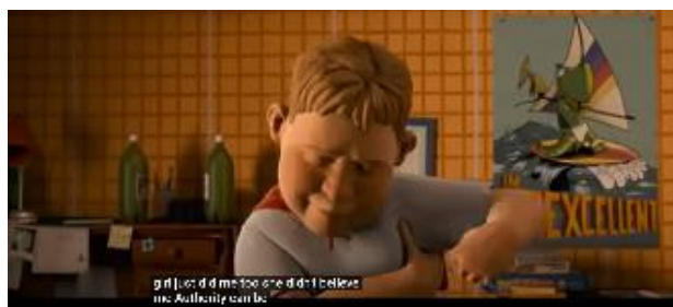
Selected Scene 21. Chowder mocking authority with a fart noise Source: Captured and documented by the researcher from Monster House (2006)