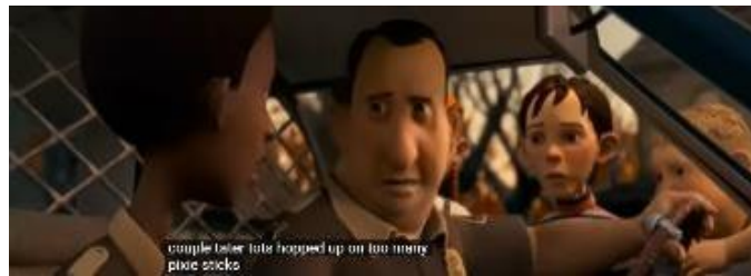
Selected Scene 19. Officer Landers mocking another officer as “tater tots hopped up on Pixy Stix”