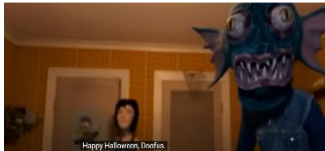
Selected Scene 2. Bones insulting DJ by calling him a “doofus”