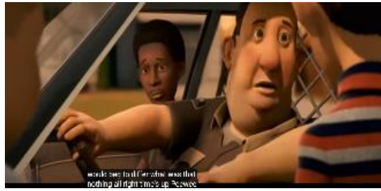
Selected Scene 24. Police mocking DJ and friends by calling them “peewee” Source: Captured and documented by the researcher from Monster House (2006)