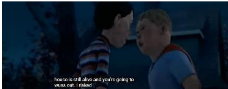
Selected Scene 14. DJ confronting Chowder for wanting to “wuss out”