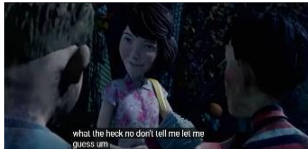
Selected Scene 6. DJ' mom exclaiming "What the heck" in shock with DJ and Chowder dirty body