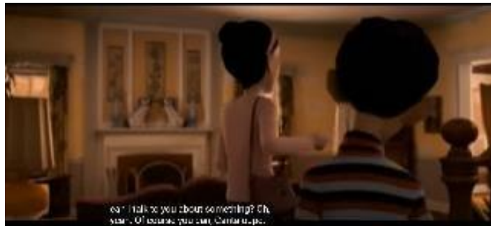
Selected Scene 25. Zee teasing DJ with the silly nickname “Cantaloupe”

Zee uses “Cantaloupe” as a random nickname, silly nickname slang that relies on absurdity. Still trendy in today’s ironic nicknaming culture. It builds sibling dynamics and affection cloaked in mockery. Fast Five lacks such emotional layering. This type of slang was absent from Yuda Pramana & Santika’s study, showing how Monster House captures relational nuance through playful naming.