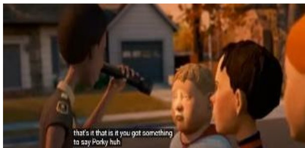
Selected Scene 17. Chowder being insulted with the word "porky"

This insult targets body size, classified as name-calling/insult slang. It's increasingly outdated due to body positivity movements, though it persists in ironic contexts. Chowder's teasing paints him as both victim and clown. The word reflects societal norms of the mid-2000s, showing how slang ages culturally. Fast Five insults are status-based, not appearance-focused. This shows Monster House capturing a different axis of social judgment absent in Yuda Pramana & Santika's study.