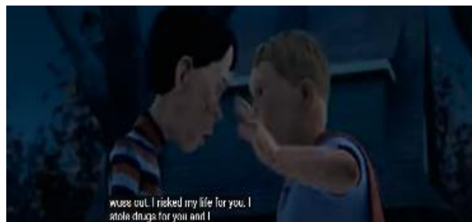
Selected Scene 11. Chowder saying "I stole drugs for you" dramatically

Chowder delivers this line to show extreme loyalty. It's absurd exaggeration, a comedic tool still prevalent in today's hyperbolic meme culture. The phrase amplifies Chowder's devotion while mocking melodrama. It aligns with Gen Z's taste for ironic sincerity. Fast Five characters show loyalty through actions, not absurd words. Yuda Pramana & Santika didn't analyze exaggeration as slang, which makes this instance uniquely valuable for youth media discourse.