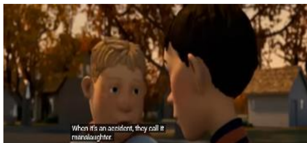
Selected Scene 4. Chowder humorously misusing the term "manslaughter"

exaggeration and naïve fear rather than real threat, an aspect not captured in Yuda's adult-targeted framework.