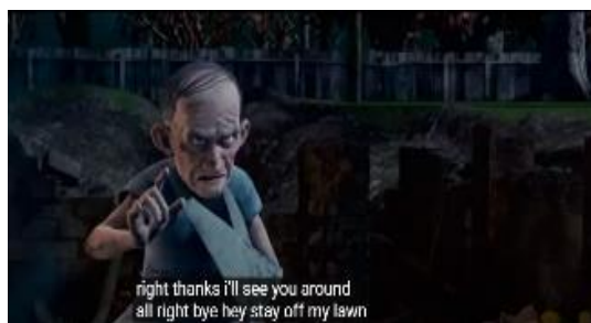
Selected Scene 8. Nebbercracker yelling "Stay off my lawn" at DJ and Chowder