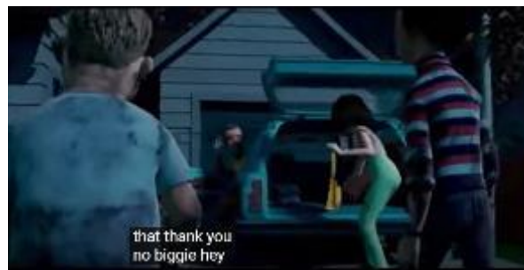
Selected Scene 7. Chowder downplaying the situation by saying "No biggie"

Its use in Monster House shows how kids manage minor conflicts using humor and indifference behavior typical in youth interactions. In contrast, Fast Five prioritizes intense, confrontational dialogue, rarely featuring softening language like this. Yuda Pramana & Santika did not explore emotionally mitigating slang, which highlights a key difference in genre and audience: Monster House normalizes reassurance within peer talk, making comfort slang a subtle yet meaningful narrative device.