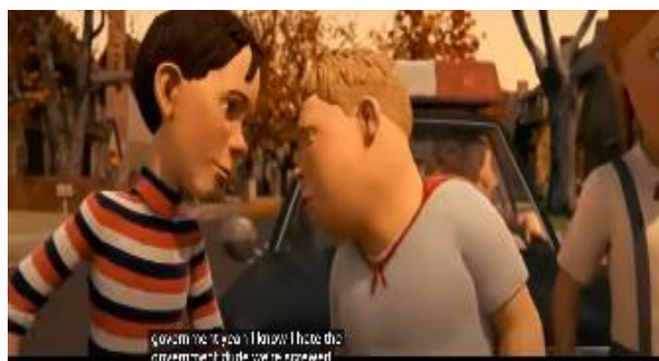
Selected Scene 23. Chowder realizing danger and saying "we're screwed"