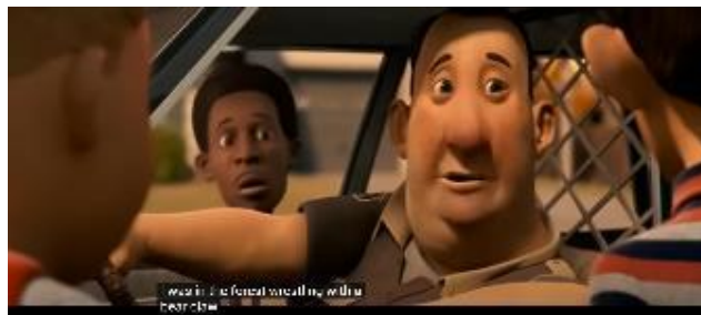
Selected Scene 20. Officer joking about a “bear claw” with double meaning Source: Captured and documented by the researcher from Monster House (2006)