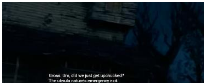
Selected Scene 15. Jenny mistaking the uvula for “nature’s emergency exit” Source: Captured and documented by the researcher from Monster House (2006)