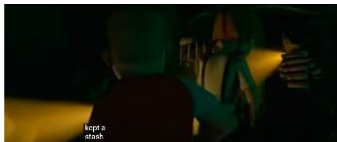
Selected Scene 16. The boys discovering Nebbercracker had “kept a stash”